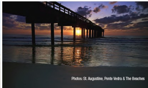
Photos: St. Augustine, Ponte Vedra & The Beaches